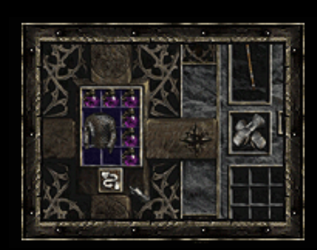
[ Click to Enlarge - 116 KB ]

Place items into the Horadric Cube by picking them up, dragging them over the Horadric Cube, and left click on the Horadric Cube. You will hear a sound when the item is placed into the Cube. You can also pick the Horadric Cube, drag it over a large item you want to pick up, and left click on that item to place it into the Cube. You can also open up the Cube by right clicking on it like a Tome. Drag items from your inventory into the Cube.